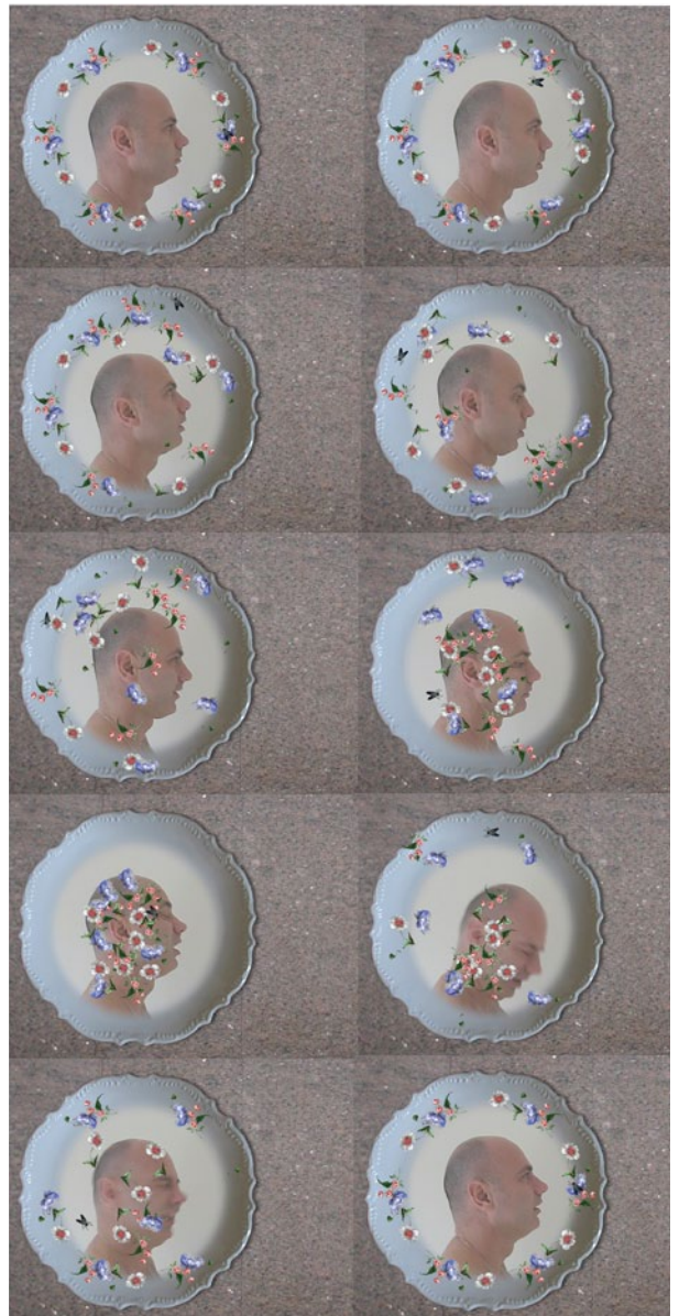
Your Breath That Passes Through , 2009. Video intervention held during the Montreal High Lights Festival. Porcelain plate and video projection. 40 cm/dia.

Decorative objects played a crucial role in Les Vases Communicants , his most recent gallery exhibition. Reconstructed in the small exhibition hall was part of a well-to-do living or office space. Two porcelain copies of Sevres vases stood on an Empire style secretary; above it, a white faience dish hung on a background of red wallpaper whose vine tendril motifs acted as