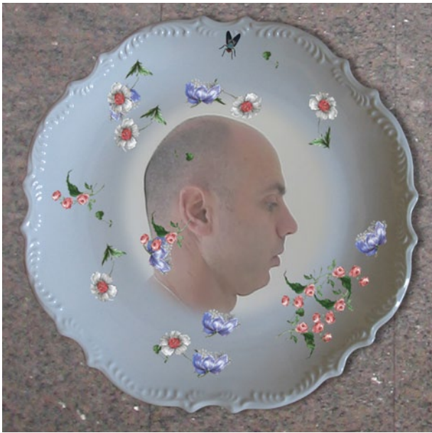
Your Breath That Passes Through (Detail) , 2009.